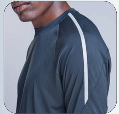
PANELLED RAGLAN SLEEVES WITH REFLECTIVE DETAIL