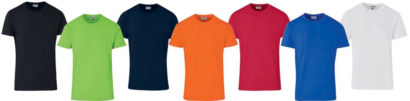
ALT-ASMS, ALT-ASLS & ALT-ASKS ARE AVAILABLE IN THE 7 COLOURS SHOWN ON THIS PAGE