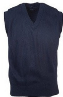
MENS S/LESS IN NAVY