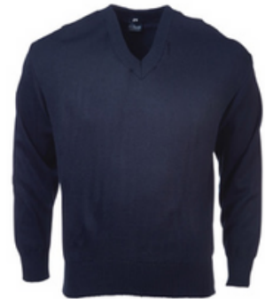
MENS L/S IN NAVY