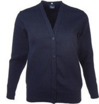
LADIES CARDIGAN IN NAVY