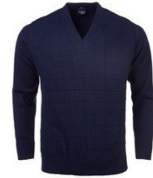
MENS L/S IN NAVY