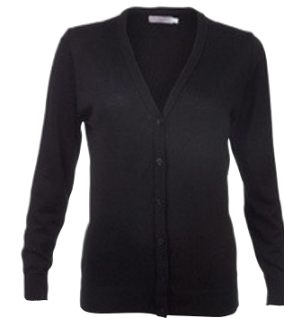
LADIES CARDIGAN IN BLACK