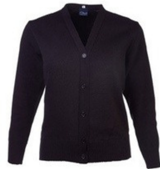
LADIES CARDIGAN IN BLACK