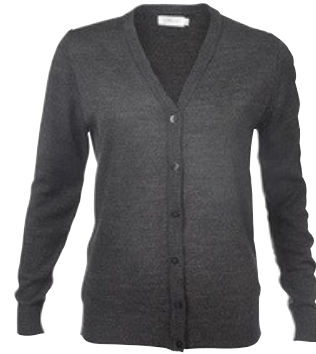
LADIES CARDIGAN IN CHARCOAL