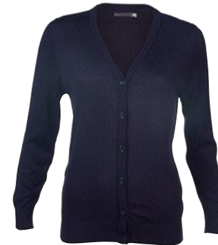
LADIES CARDIGAN IN NAVY