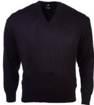
MENS L/S IN BLACK