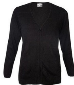
LADIES CARDIGAN IN BLACK