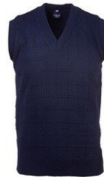
MENS S/LESS IN NAVY