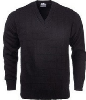
MENS L/S IN BLACK