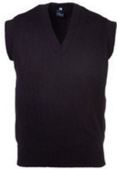
MENS S/LESS IN BLACK