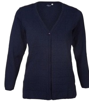
LADIES CARDIGAN IN NAVY