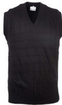
MENS S/LESS IN BLACK